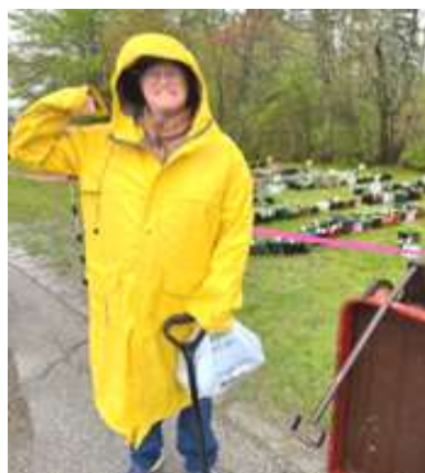
Additionally, six members assisted the Amherst Garden Club with a plant sale on 5/9 & 10.