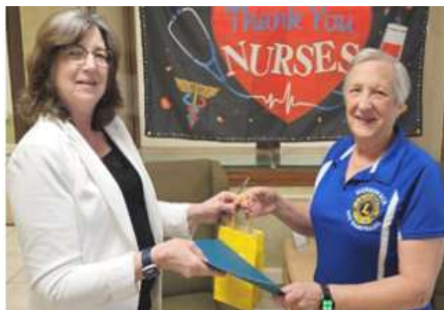
Honored Nurses at Hillsborough County Nursing Home with Dunkin Donuts and Starbucks coffee cards for National Nurses Week. They do such great job!