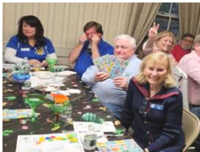
Eleven Merrimack Lions joined in the fun at the Milford Lions' Cinco de Mayo meeting