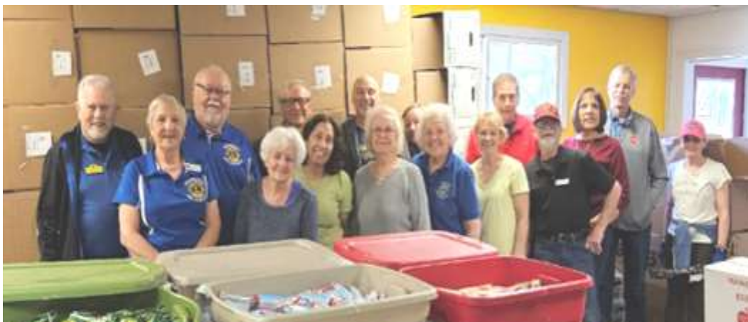
On April 23rd, Merrimack Lions joined the Bedford, Goffstown, Manchester and Pinardville Lions to pack 1,200 food bags for Manchester children to have over school vacation.