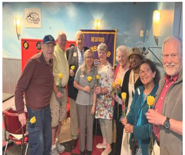
2024-2025 Board of Directors