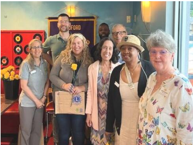
New Bedford Lion Members