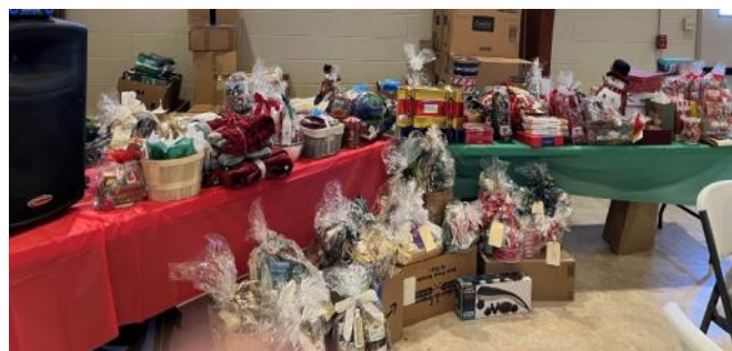
Above plentiful amount of gifts and gift baskets that were raffled off to the attending Seniors. Below, a snapshot of our Senior guests enjoying the meal.