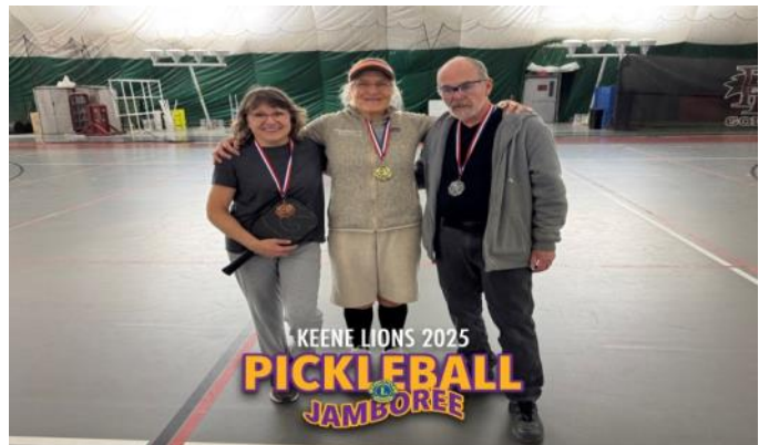
Keene Lions held their 2025 Winter Pickleball Tournament at Franklin Pierce College – 60 players attended and enjoyed the nice six indoor courts.