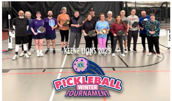
Above: Keene Lions Tournament Co-Ed Group Below: Jamboree Beginner Medal Recipients