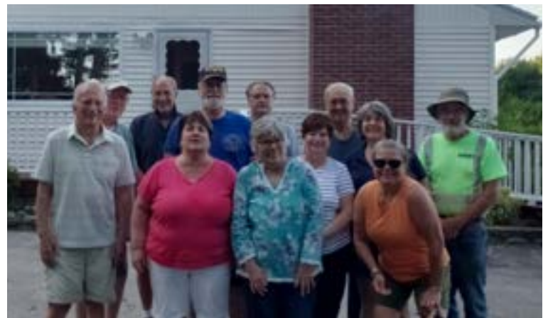
The whole clean-up crew.