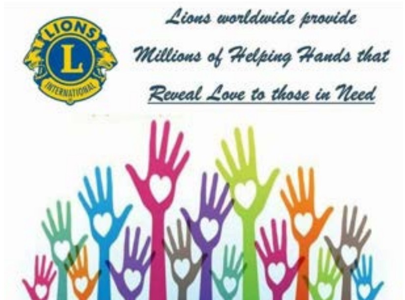
Operations KidSight 2022-2023