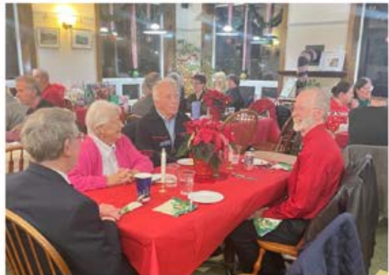
Peterborough and Jaffrey/Rindge Lions and guests at our Christmas party.

Had another successful Christmas tree sale. Valley Automotive for providing the sales venue and collecting money for trees when Lions were not on site. This year we collected gently used shoes while selling trees and sent them to Soles4Souls. We were honored to have Jaffrey/Rindge Lions join us for our annual Christmas party for food, fellowship, and fun. The Scholarship Committee meet to discuss the recipient of the last award and review the requirements for the next one. We continue to collect plastic and can tabs to recycle. We are looking forward to restarting eye screenings.