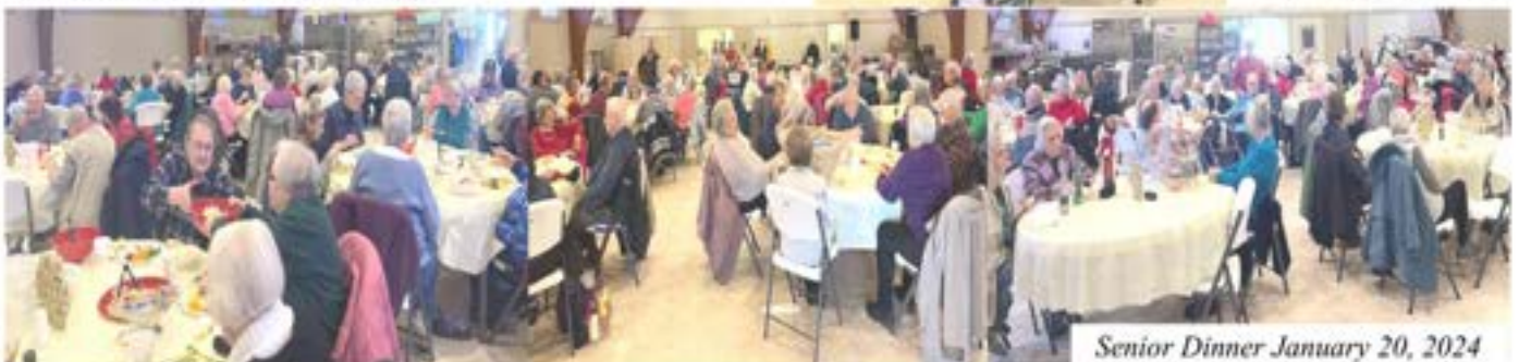
Senior Dinner January 20, 2024