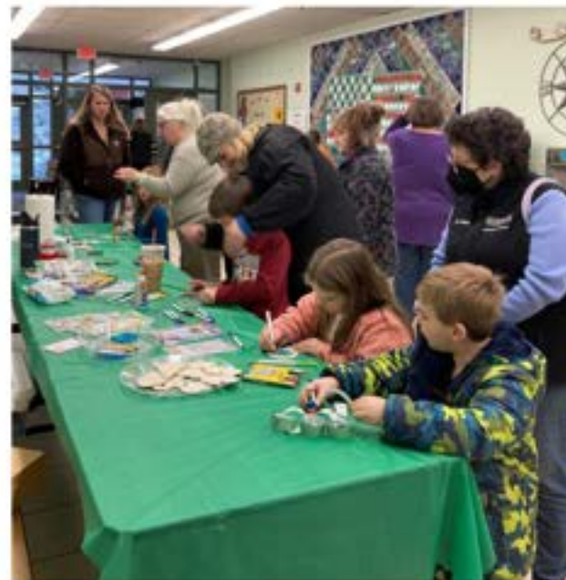
Kid's Craft Corner – lots of fun!

Lioness also prepare meals on weekends for the Lion members that spend long hours covering the Christmas Tree Sales.