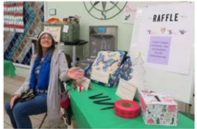
Thanksgiving Dinner Raffle

The Lioness were really busy during the month of November! Frosty's Craft World had one hundred percent participation by active members – baking, shopping, serving lunch, covering the various tables and preparing the gym for crafters. The kid's Craft Corner was a big hit making Christmas ornaments and/or Christmas Cards for family and Granny's Attic was forever busy. Attendance was great & crafters did well – a very successful holiday event!