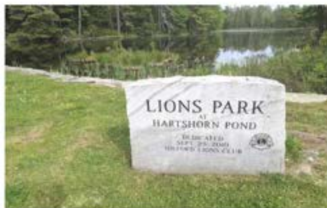
Entrance to the Milford Lions Park at Hartshorn Pond

We are in receipt of our 6th Bench from the Trex Recycling project. Plans are to place it within the Lions Park in Milford. The Lion's Park at Hartshorn Pond was dedicated on September 25, 2010 attended by our special guest Governor Lynch a little over 13 yrs ago. A stone was placed at the entrance to the park located off of Route 13. The park sits in front of the pond where ducks, geese and more dominate the area. Many visit the park for a small picnic, watching the geese or just sitting to soak up the tranquility. As of the end of August, the Trex challenge has been changed from a 500 lb collection in a 6 month time period to a 1000 lb collection along with a photo of each collection on a yearly basis. Our next challenge for a 7th bench has already begun, with over 200 lbs already collected thus far.