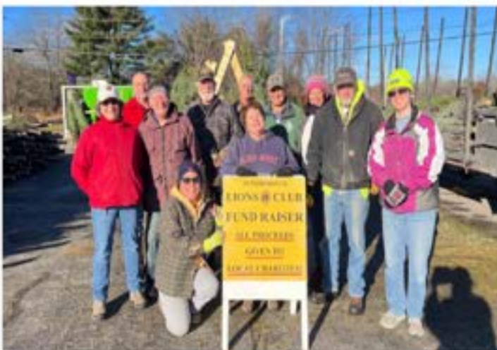
Christmas tree unloading crew