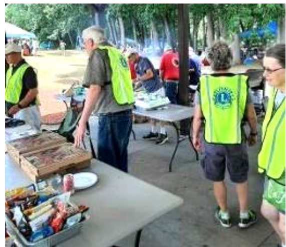
Lions working at the recent Swim Meet at Keyes Field

The Enfield club wagon was in full force during the month of August. First at the Canaan Old Home Days and then a very busy three days at the Cornish NH Fair. It took a great deal of preparation for the delicious specialties provided – famous fries, sausages with peppers & onions, steak & cheese, chicken tender and hamburger meals. The wagon will finish up the year at the Enfield-Mascoma High School bonfire evening in September.