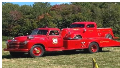
Littleton 2021 Fall Foliage Meet