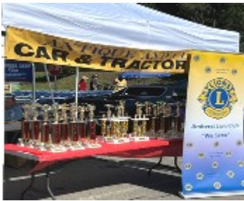
Trophies to be given out