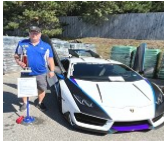
Won Exotics & Peoples Choice