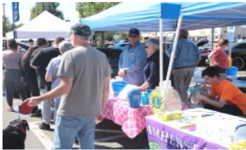
Food and Info Tent