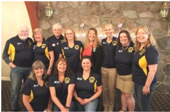
Chesterfield Lions at 44N Spring Convention

We are working hard on the Annual Golf Tournament which will be held July 11. This is our biggest fundraiser and activity of the year and all hands are on deck to help out.