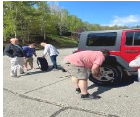
The question asked, "how many does it take to fit a flat tire"? Answer, some of the best and kindest. Many thanks for the help, so much appreciated!