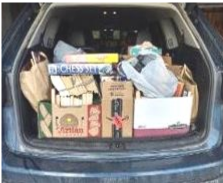
Some of the gifts collected for the kids at CHaD