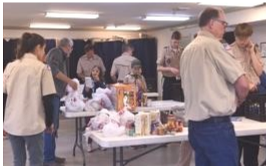
Scouting for food