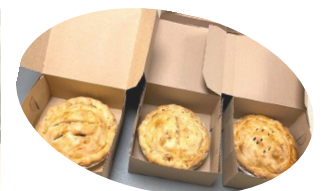
BAKING & MAKING PIES!