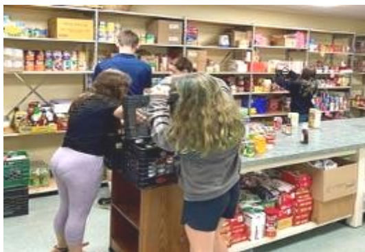
Stocking shelves at the food pantry