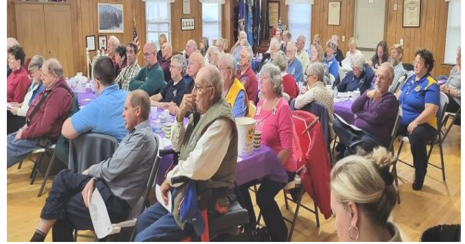
November 13, 2022 District 44N Cabinet Meeting