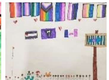
2nd place Piper Marchand