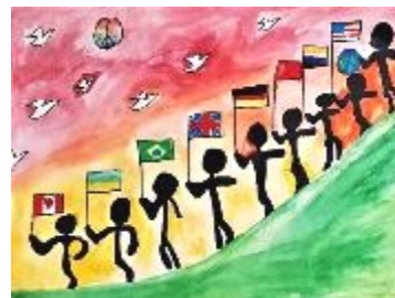
2nd place Grace Ouellette