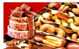
Cashew Pecan Medley (26 oz. Gift Tin)